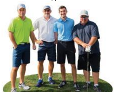
Alumni Golf Outing Saturday, October 6