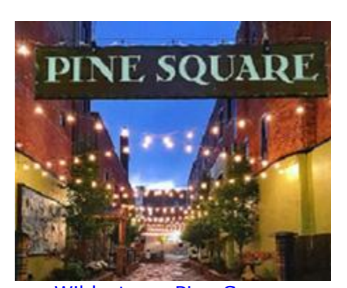
Wildcats on Pine Square Saturday, October 6