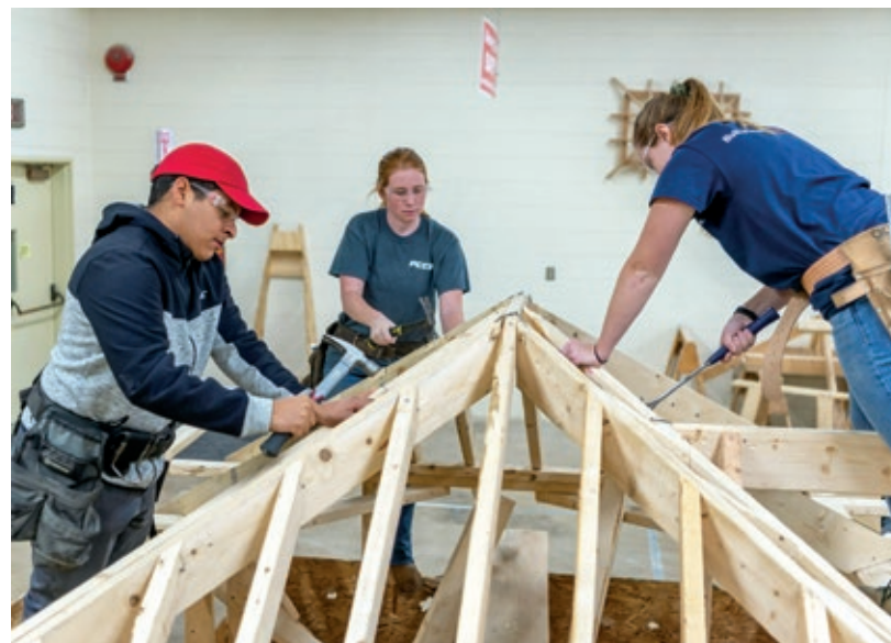
A $2 million federal grant will help to transform instructional spaces in the Carl Building Technologies Center and construct a Clean Energy Center house.