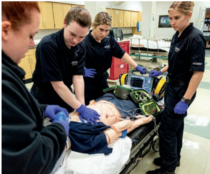
Paramedic students receive immersive instruction in the college's state-of-the-art paramedic facilities.