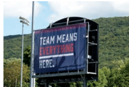
Samples of the branding work devised by the Penn College graduates include signage and banners that are prominent during Little League World Series events.

Gannon and Cropper-Rose enrolled at other institutions and focused on different subjects – music for Gannon and fine and studio arts for Cropper-Rose – before transferring to Penn College for graphic design. But all three share gratitude for their education, obtained less than 3 miles from the site of the first Little League game.